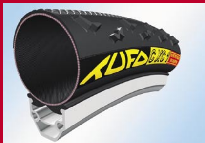
Tubular clincher on a rim after inflation